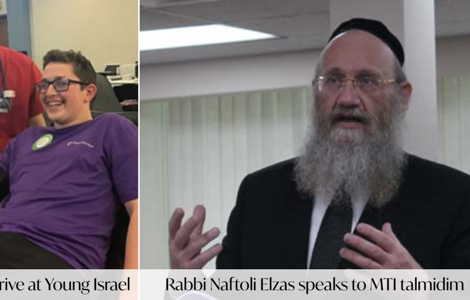
Blood Drive at Young Israel