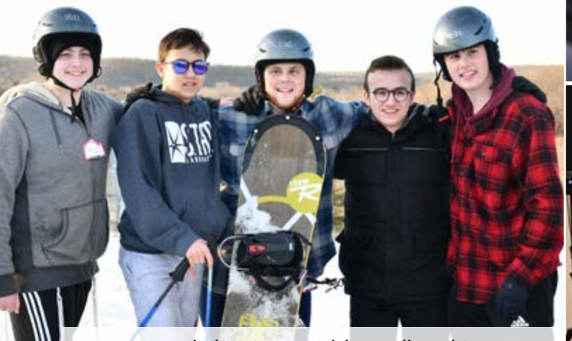
MTI Annual Ski Trip to Hidden Valley Ski Resort MTI band performs with new sound system