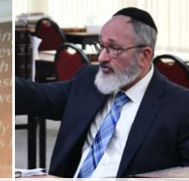
addressing bnei yeshiva