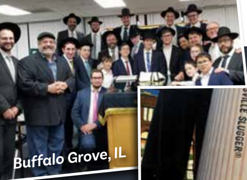
Buffalo Grove, IL