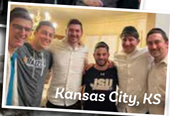
Kansas City, KS