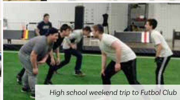
High school weekend trip to Futbol Club