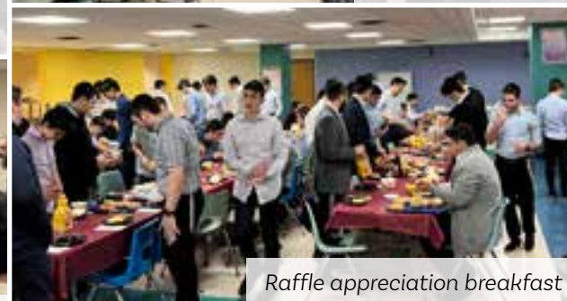
Raffle appreciation breakfast