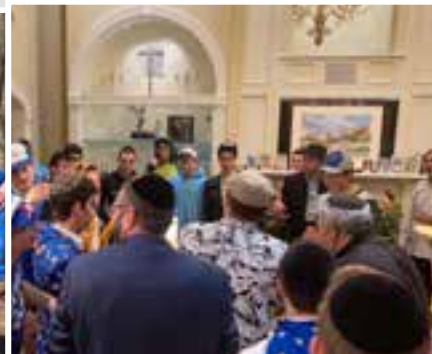
Bais Medrash visits the Deutsches on purim