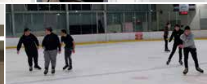
Schoolwide Achdus Trip - Kirkwood Community Center