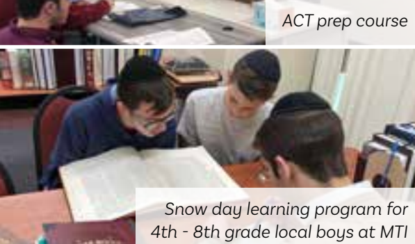
Snow day learning program for 4th - 8th grade local boys at MTI