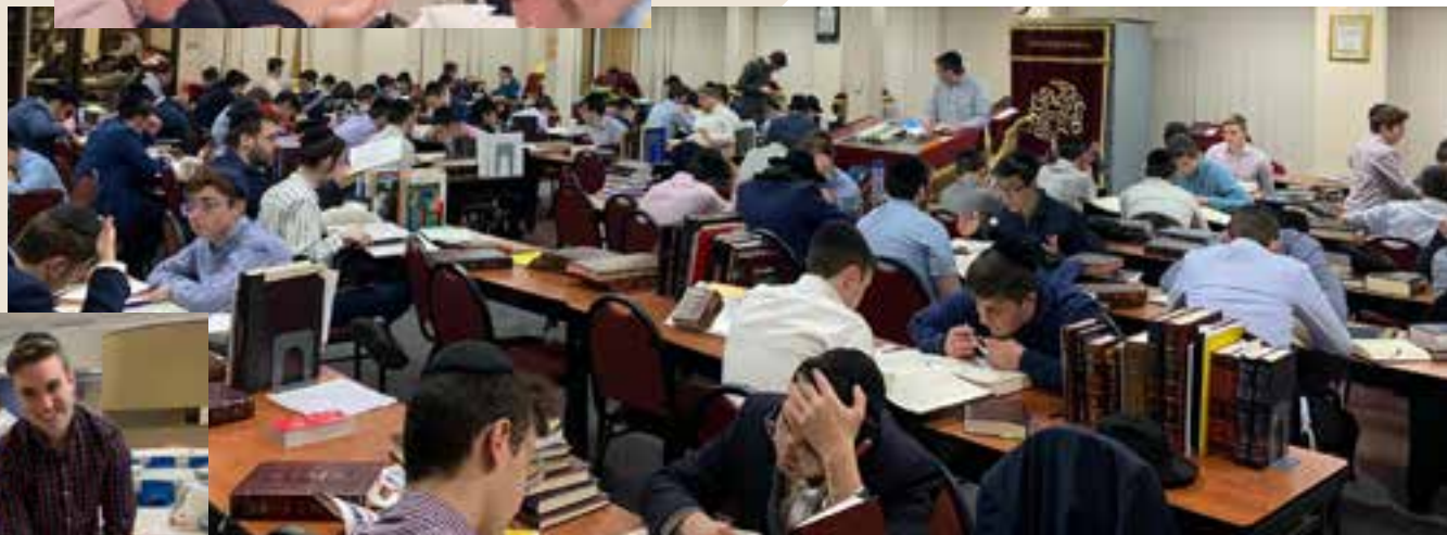
Photos from retzifus seder, poppers rewards party and a trip to TopGolf

Participants discovered the unique momentum and joy that a focused learning session could bring.