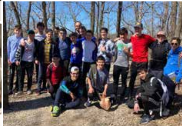
Hike at Rockwood Reservation