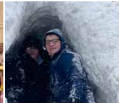
Huge igloo construction during one of our snowfalls this winter