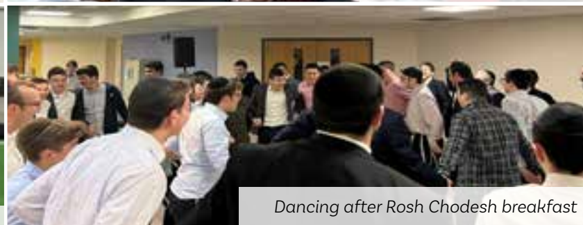
Dancing after Rosh Chodesh breakfast