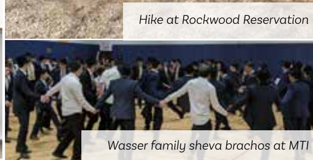
Wasser family sheva brachos at MTI