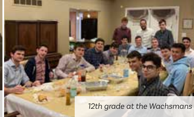
12th grade at the Wachsmans