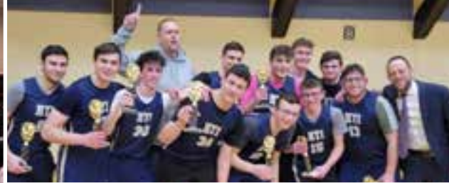
MTI Varsity team wins the championship game!