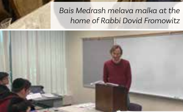
ACT prep course