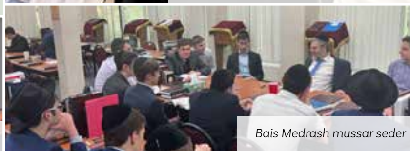
Bais Medrash mussar seder