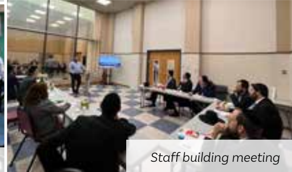
Staff building meeting