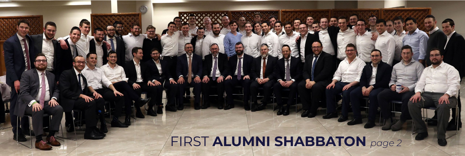
FIRST ALUMNI SHABBATON page 2

1809 Clarkson Road Chesterfield, MO 63017 636.778.1896 www.missouritorah.org