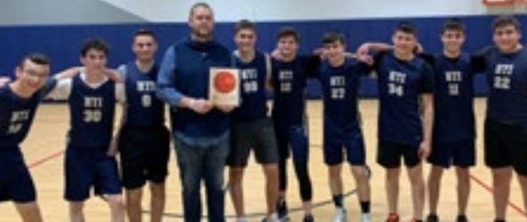
Varsity playing a basketball game against SLCHS