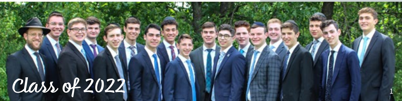
Class of 2022