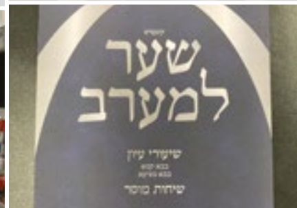
Collection of in-depth analysis of Ma'amarei Chazal culled from Mussar Shmueessin by the Roshei Yeshiva written over by MTI Talmidim