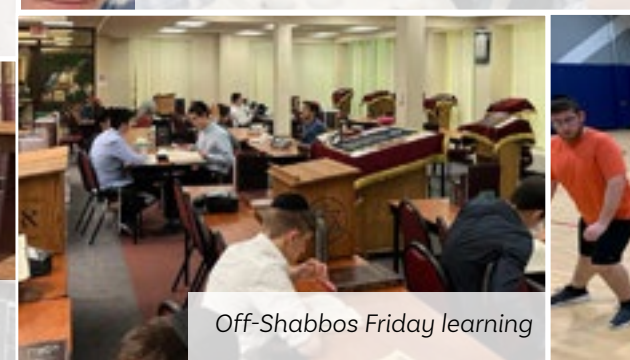
Off-Shabbos Friday learning