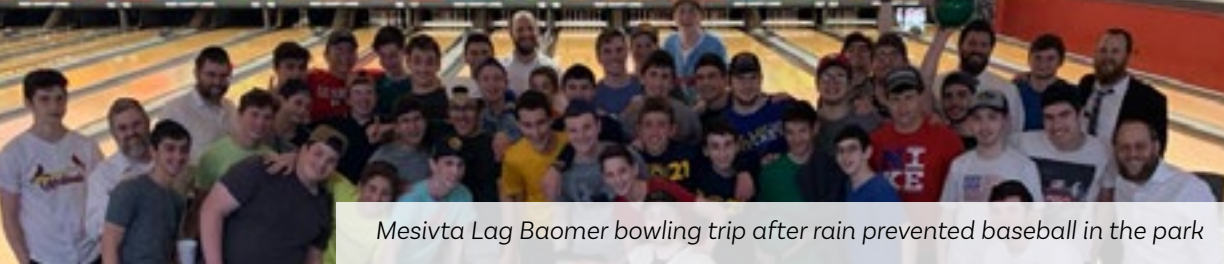
Mesivta Lag Baomer bowling trip after rain prevented baseball in the park