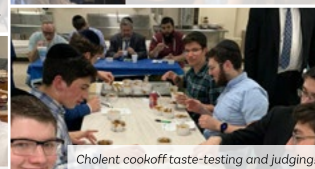
Cholent cookoff taste-testing and judging!