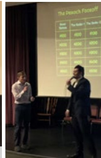
Bochorim create and host a trivia-game