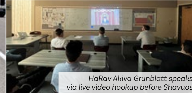
HaRav Akiva Grunblatt speaks via live video hookup before Shavuos