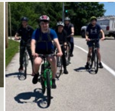
Talmidim enjoying some biking