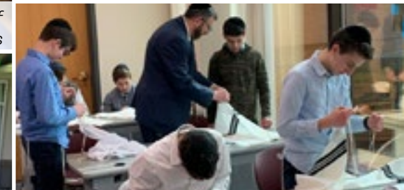
9th grade students make tzitzis after the completion of their study of hilchos tzitzis