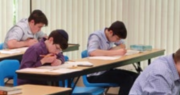
Spring standardized testing